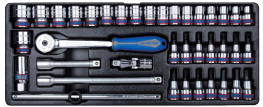
9-4338MR03 #11 P.130