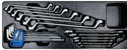
9-90121MR #12 P.130