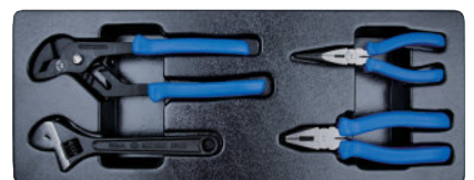
9-90104GP #12 P.130