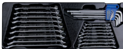
9-90126MR #12 P.130