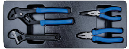
9-90104GP #12 P.130