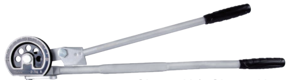
7CA11-15M / 7CA11-16M 7CA11-20S / 7CA11-24S