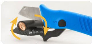
• Cable stripping