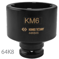
44K8 & 64K8