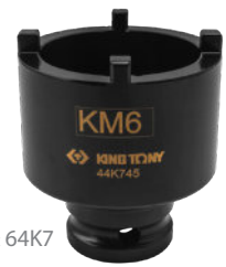
44K7 & 64K7