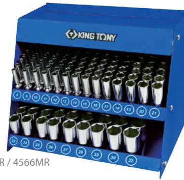
4066MR / 4566MR

Metal shelf size (mm) : 415x 336 x 320 (1.58 cuff)