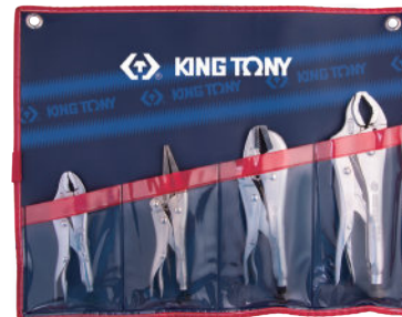
► Nylon pouch bag