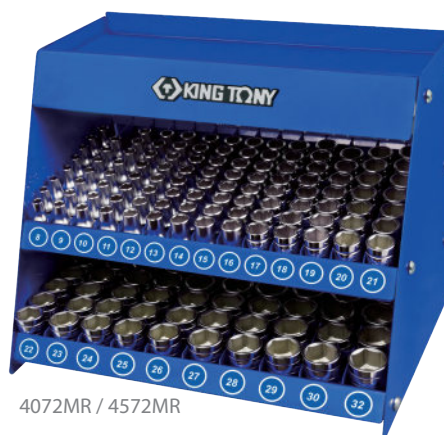
4072MR / 4572MR

Metal shelf size (mm) : 415x 336 x 320 (1.58 cuft)