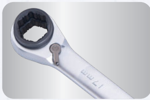
▪ Reversible ratchet with 120 teeth gear design