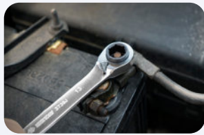
▪ Suitable for use confined space