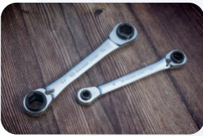
▪ Combine four general sizes in one wrench