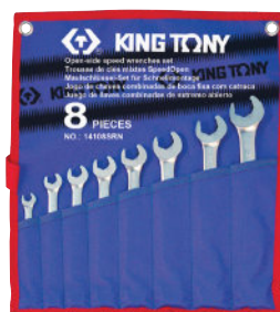
► Teton pouch bag