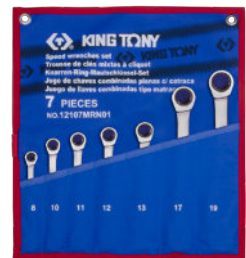
► Teton pouch bag