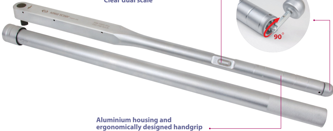
Aluminium housing and ergonomically designed handgrip