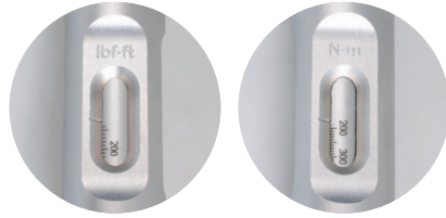
Clear dual scale

Quality accords to DIN ISO 6789:2017 & ASME B107.300-2010