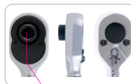
2765-04G (top, side, back)