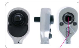
276A-04G (top, side, back)