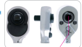
276A-04G (top, side, back)