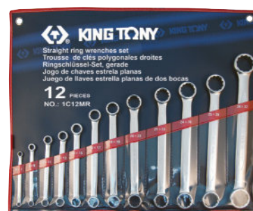
► Nylon pouch bag