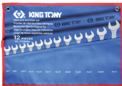
► MRN / SRN : Teton pouch bag