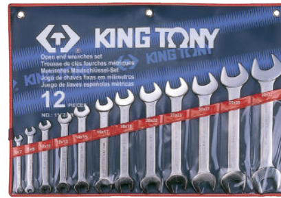
► MR / SR : Nylon pouch bag