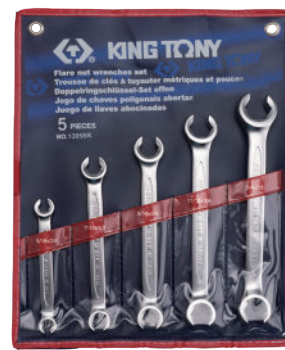
► 1305SR : Nylon pouch bag