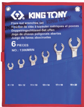
► MRN / SRN : Teton pouch bag