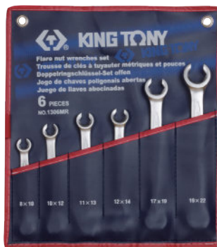
► MR / SR : Nylon pouch bag