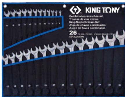
► MRN / SRN : Teton pouch bag