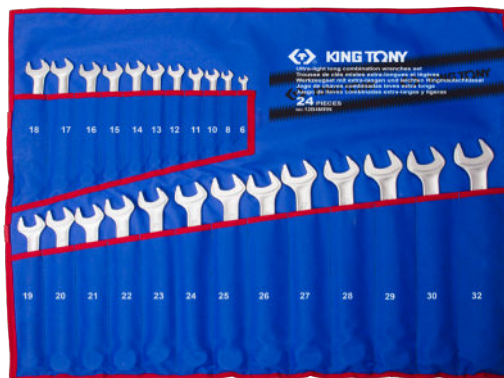
► Pouch material : Tetoron