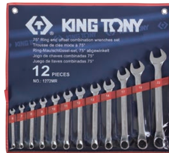
► MR / SR : Nylon pouch bag