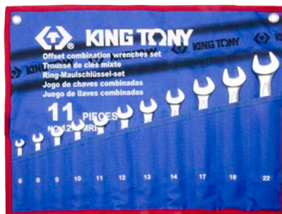
► MRN / SRN : Teton pouch bag