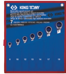
► Teton pouch bag